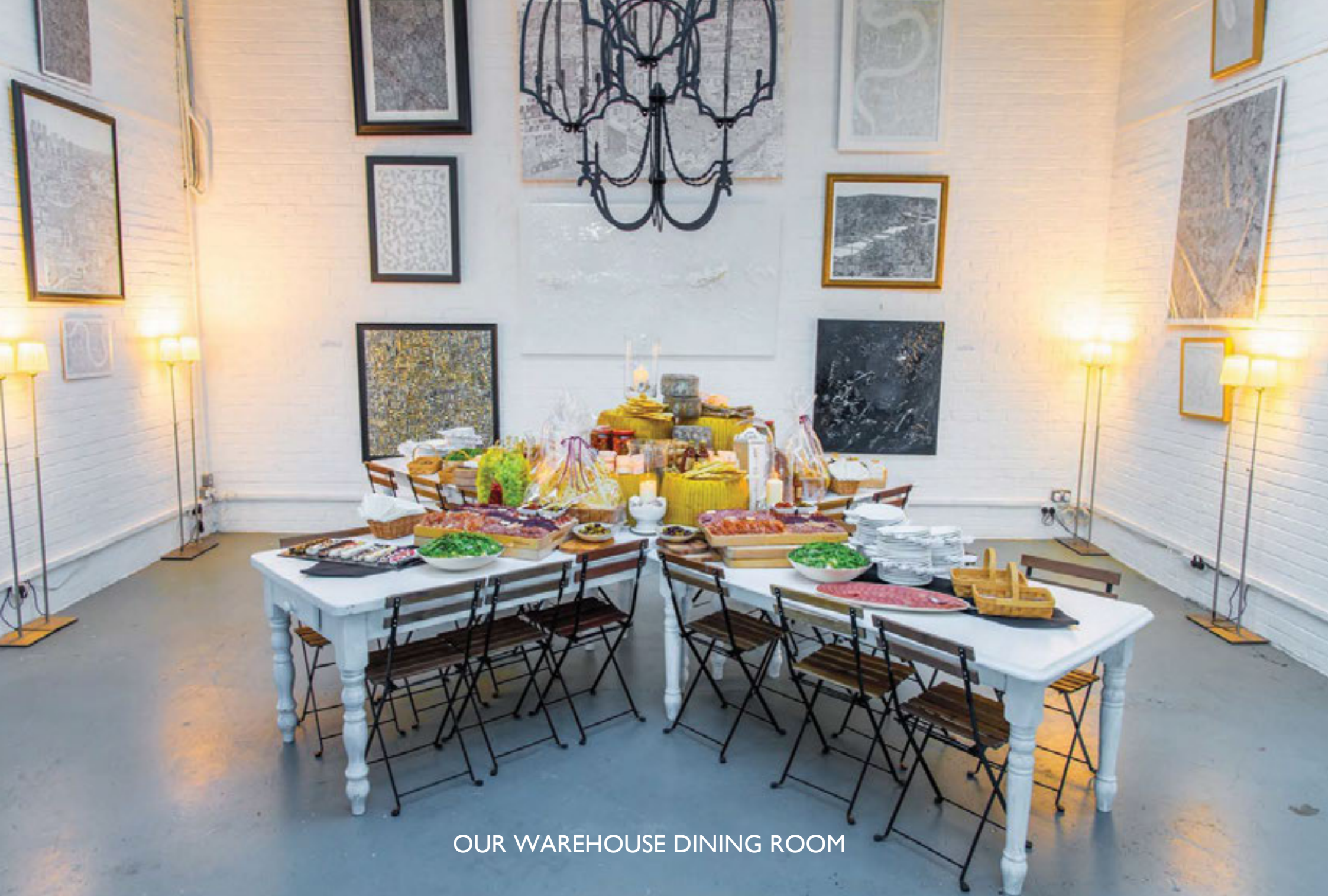
OUR WAREHOUSE DINING ROOM