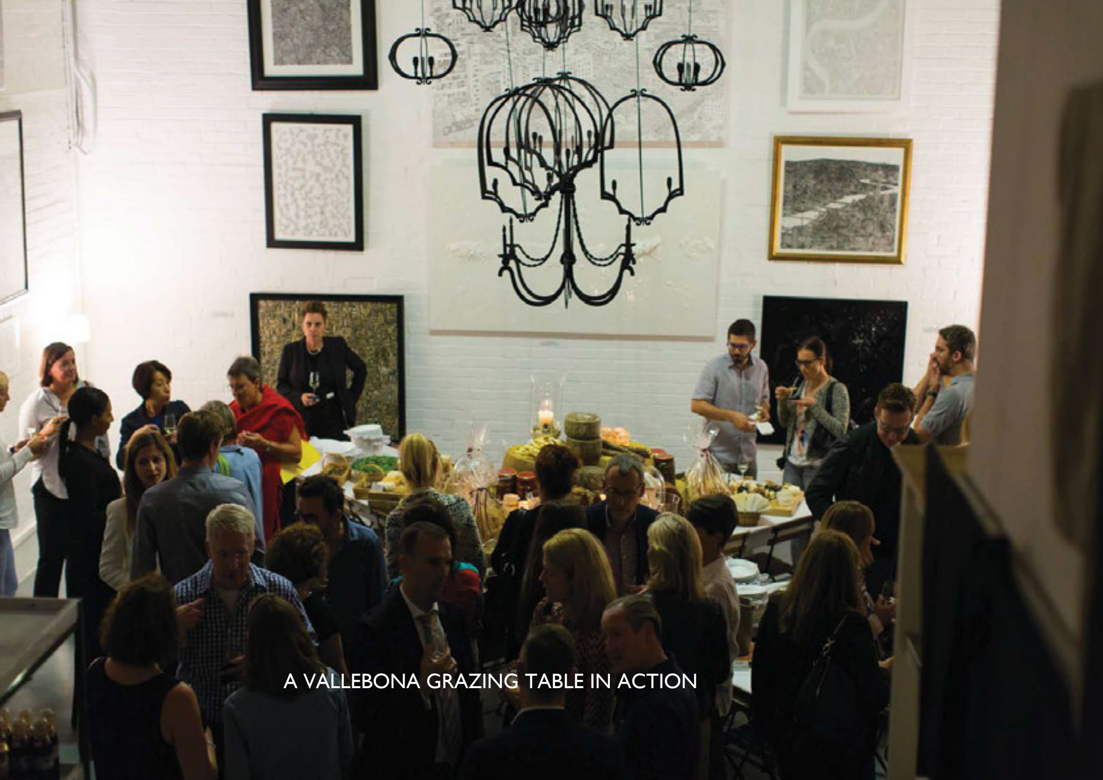
A VALLEBONA GRAZING TABLE IN ACTION