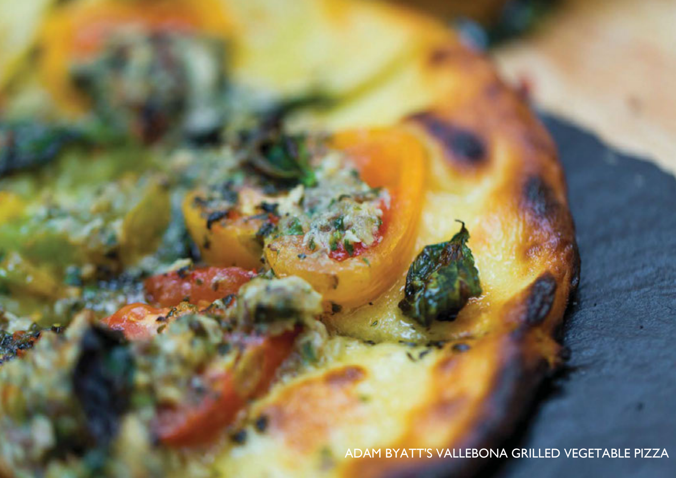
ADAM BYATT'S VALLEBONA GRILLED VEGETABLE PIZZA