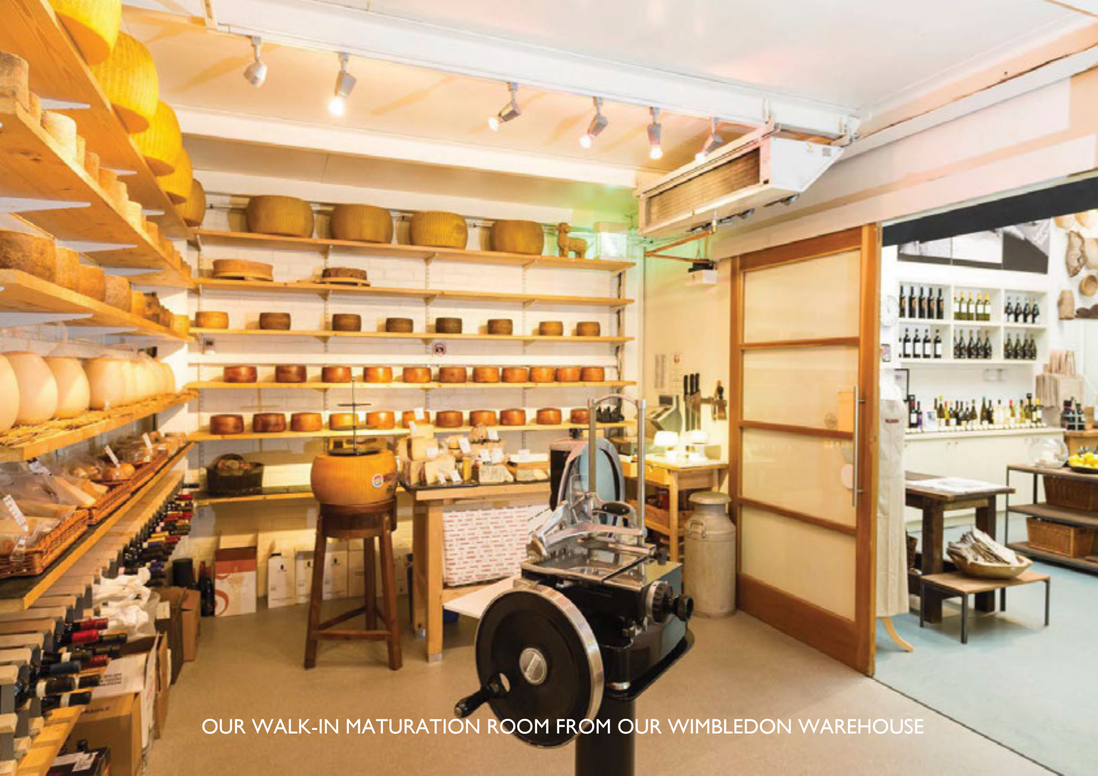
OUR WALK-IN MATURATION ROOM FROM OUR WIMBLEDON WAREHOUSE