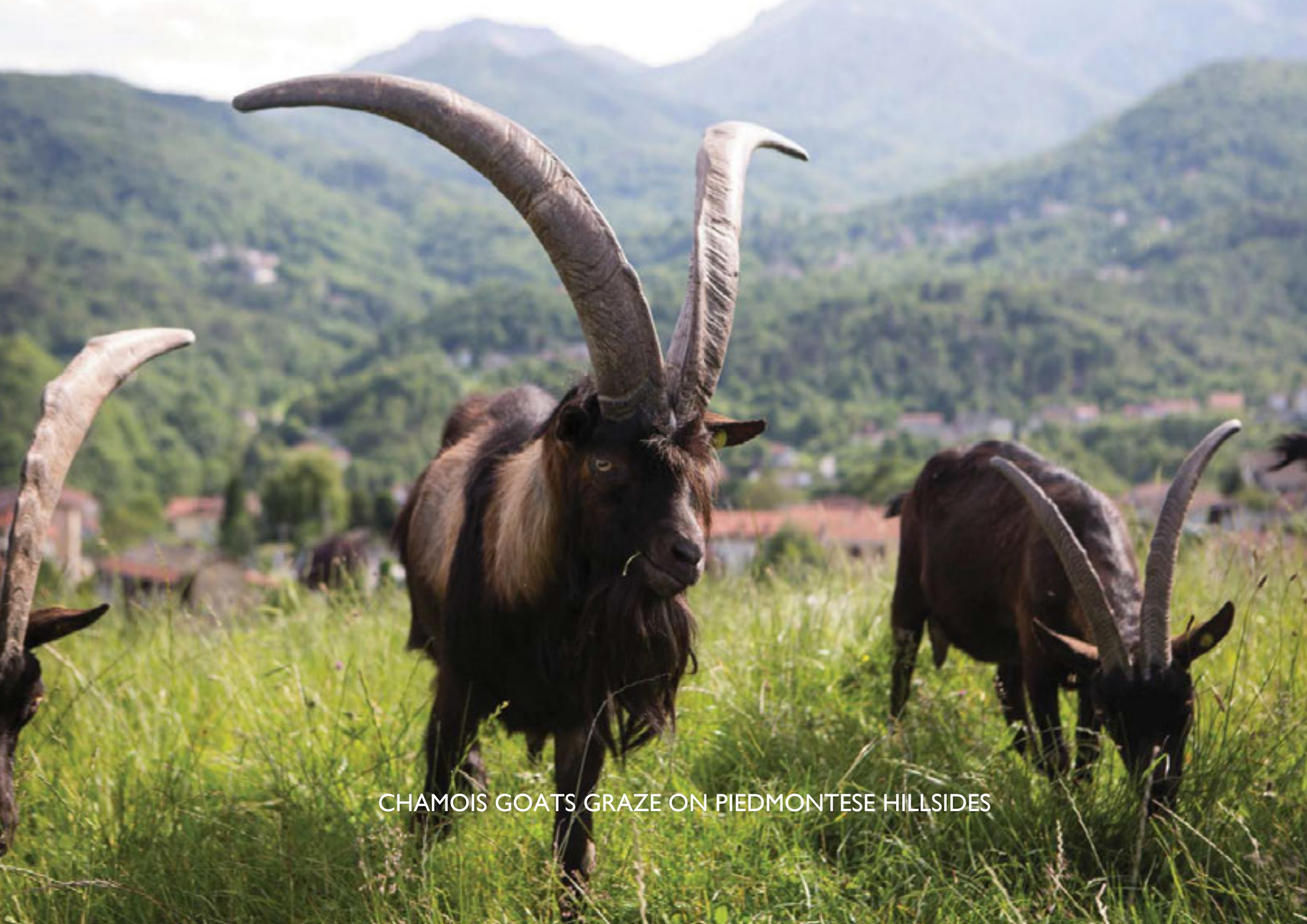
CHAMOIS GOATS GRAZE ON PIEDMONTESE HILLSIDES