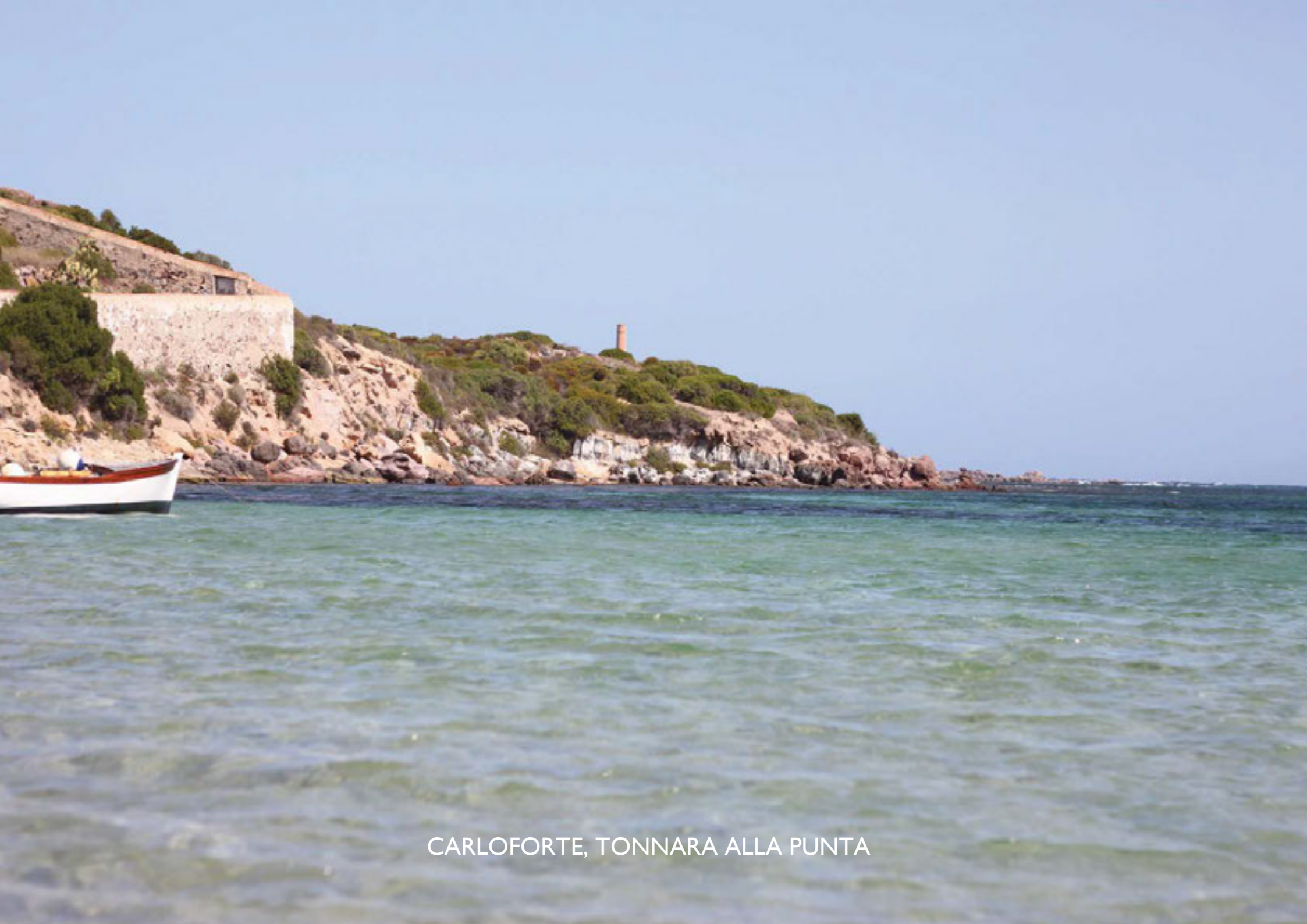
CARLOFORTE, TONNARA ALLA PUNTA