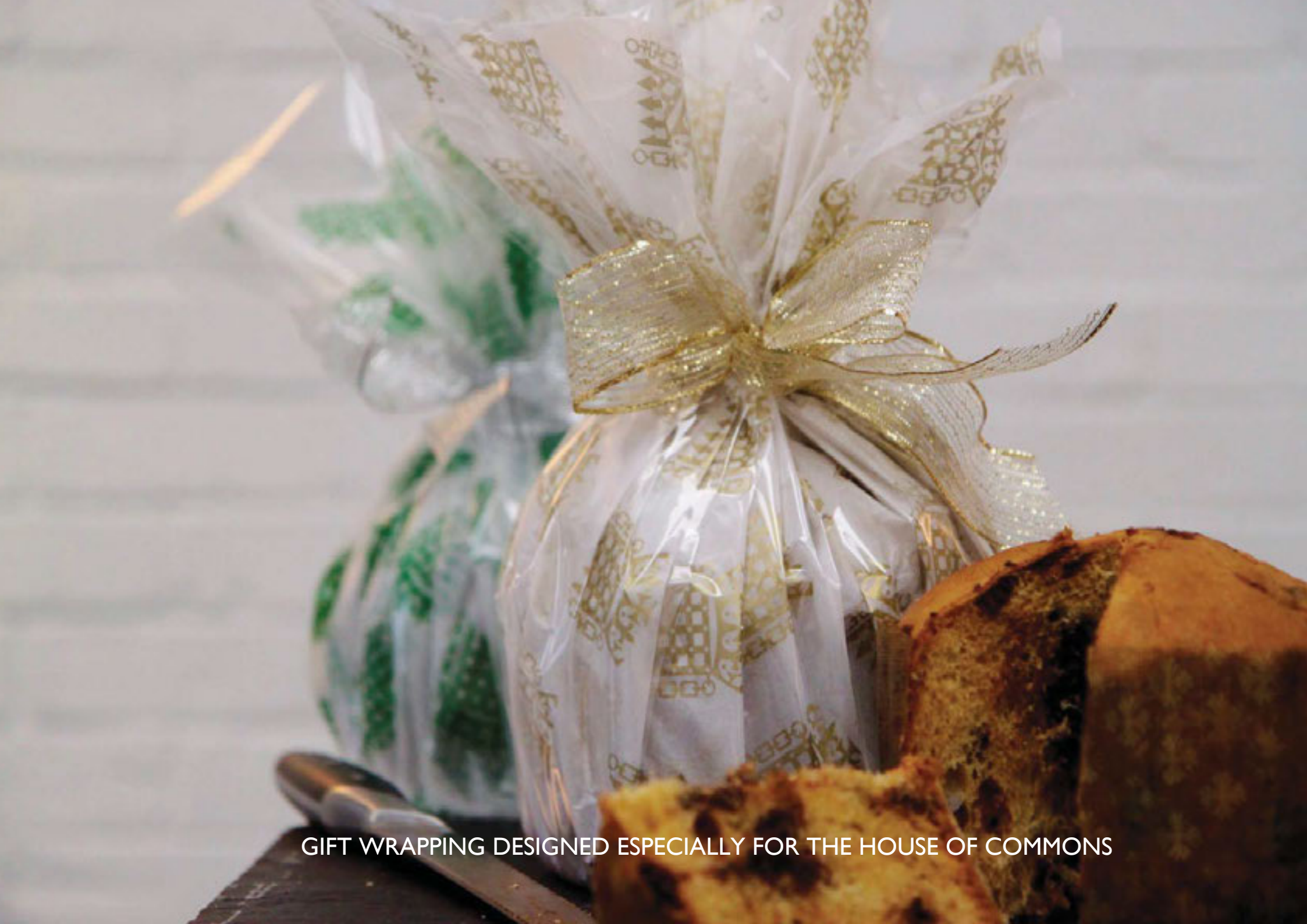
GIFT WRAPPING DESIGNED ESPECIALLY FOR THE HOUSE OF COMMONS