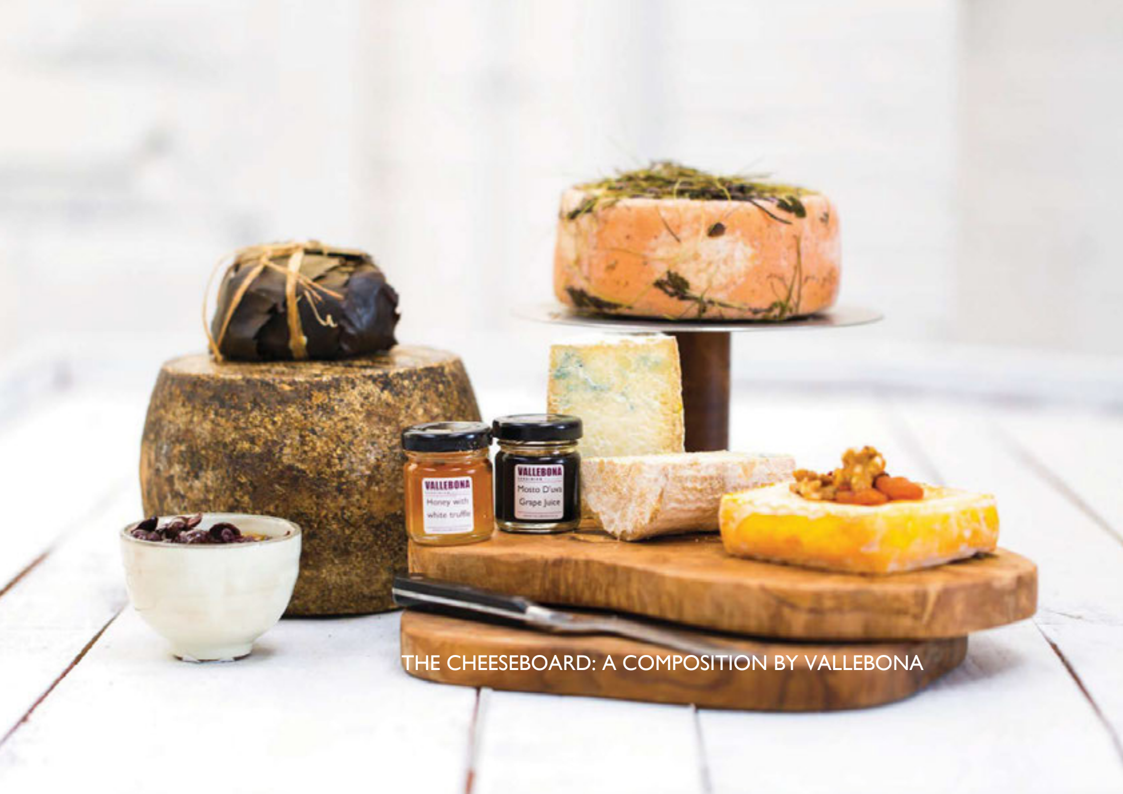
THE CHEESEBOARD: A COMPOSITION BY VALLEBONA