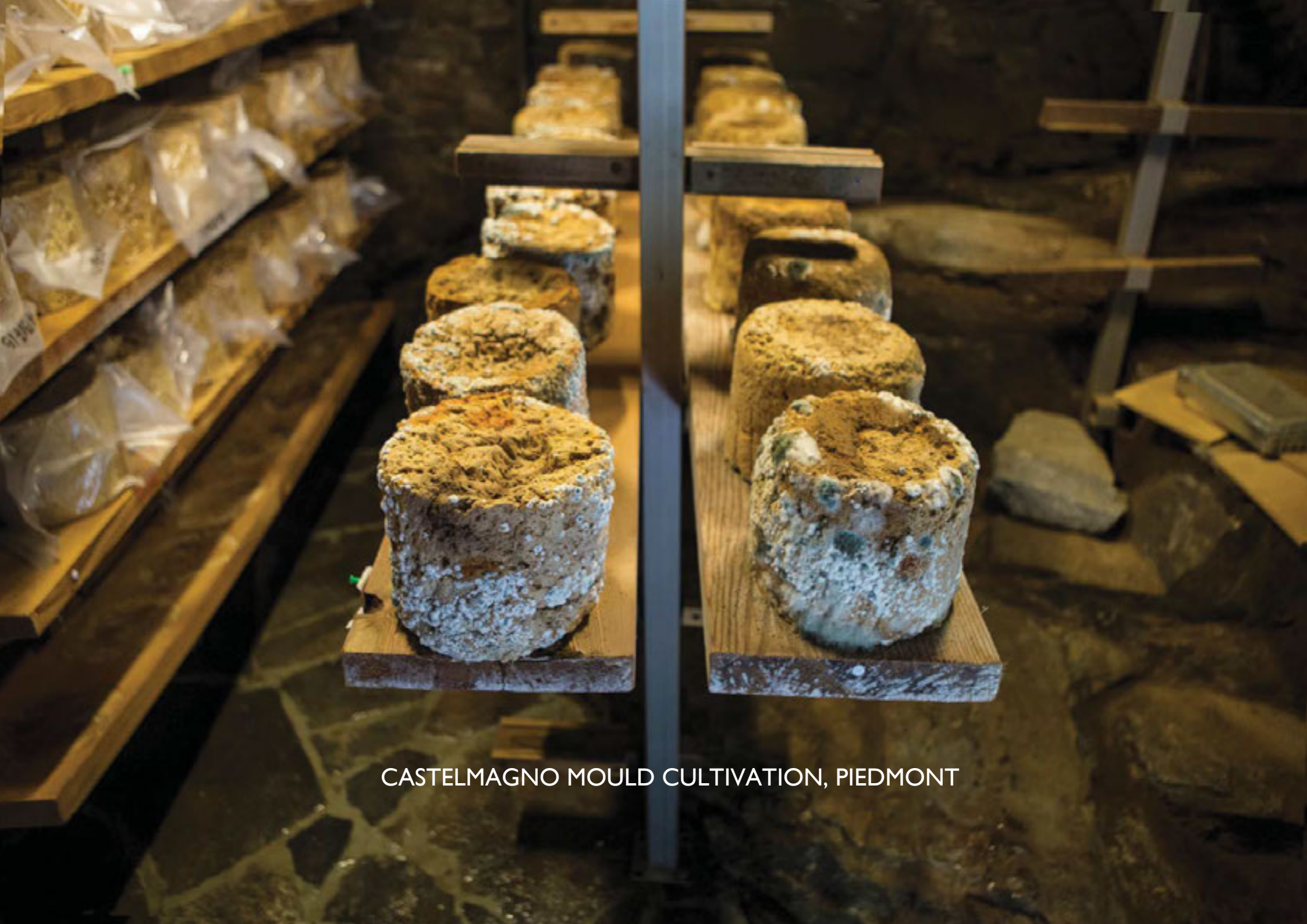
CASTELMAGNO MOULD CULTIVATION, PIEDMONT