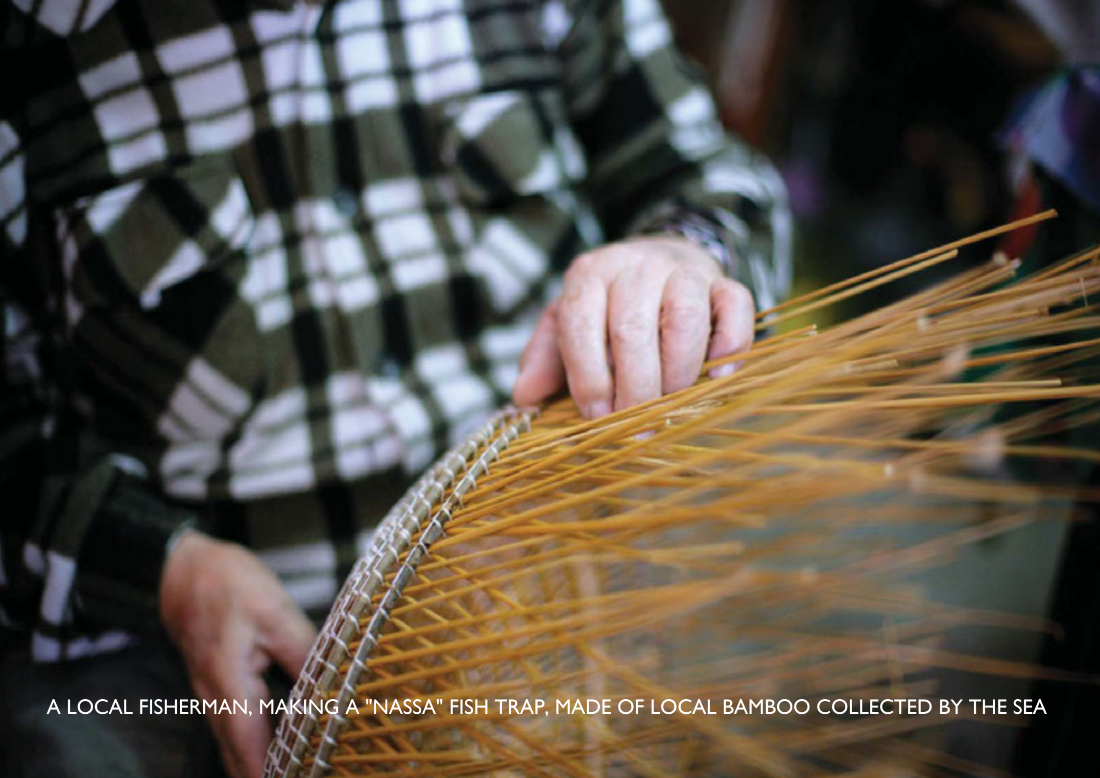
A LOCAL FISHERMAN, MAKING A "NASSA" FISH TRAP, MADE OF LOCAL BAMBOO COLLECTED BY THE SEA