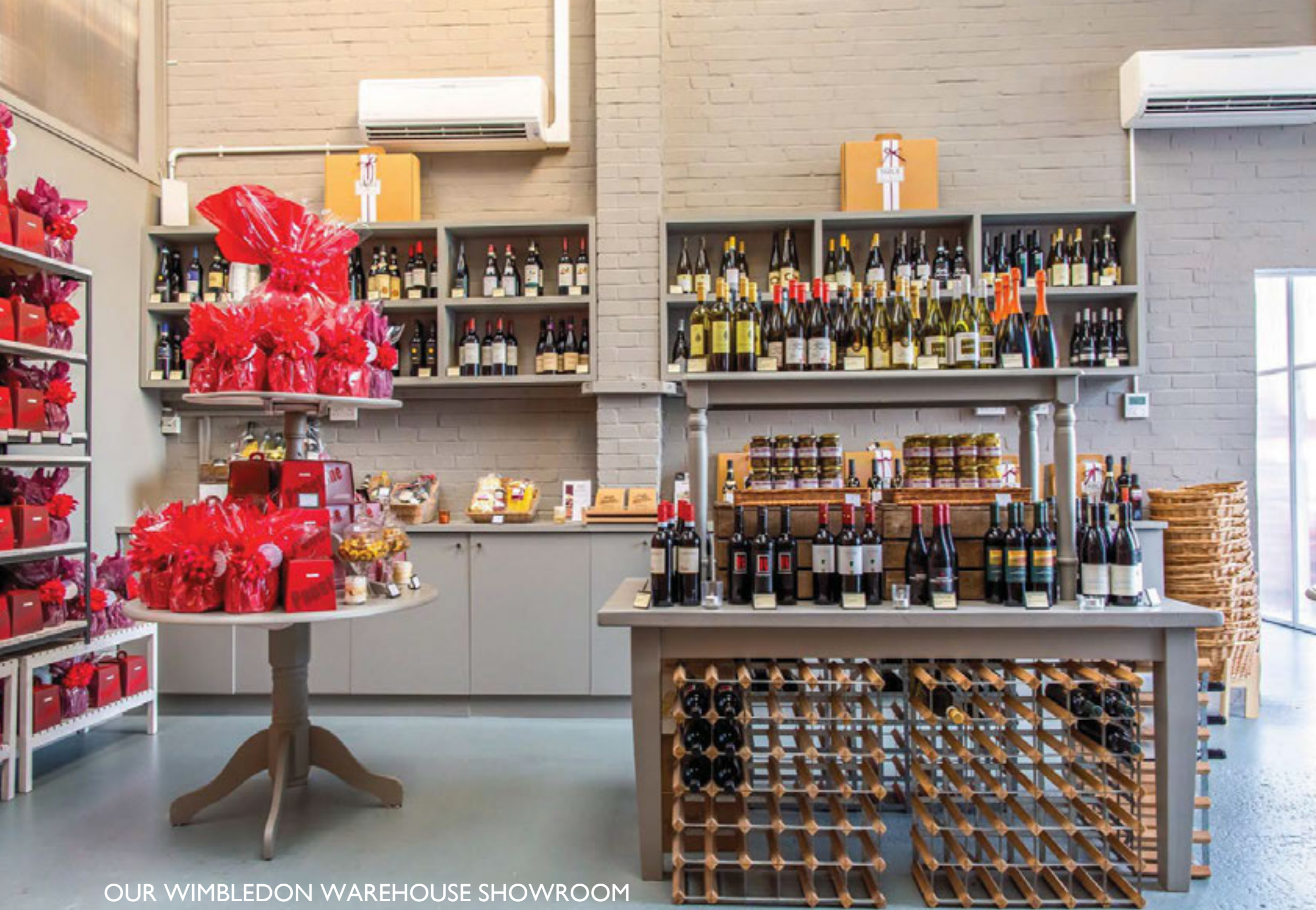
OUR WIMBLEDON WAREHOUSE SHOWROOM