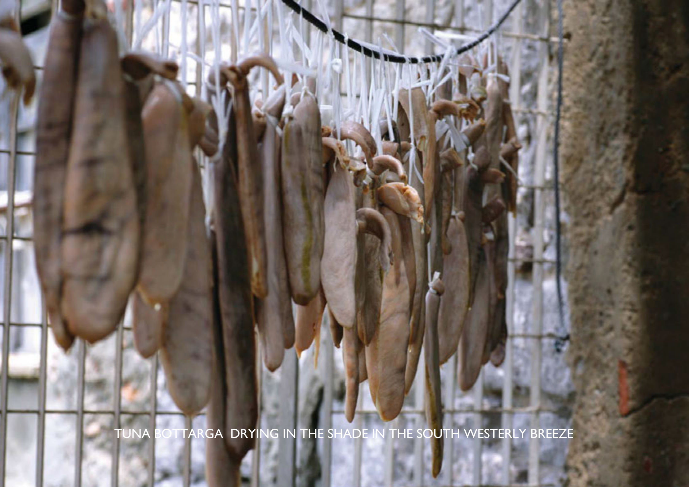
TUNA BOTTARGA DRYING IN THE SHADE IN THE SOUTH WESTERLY BREEZE