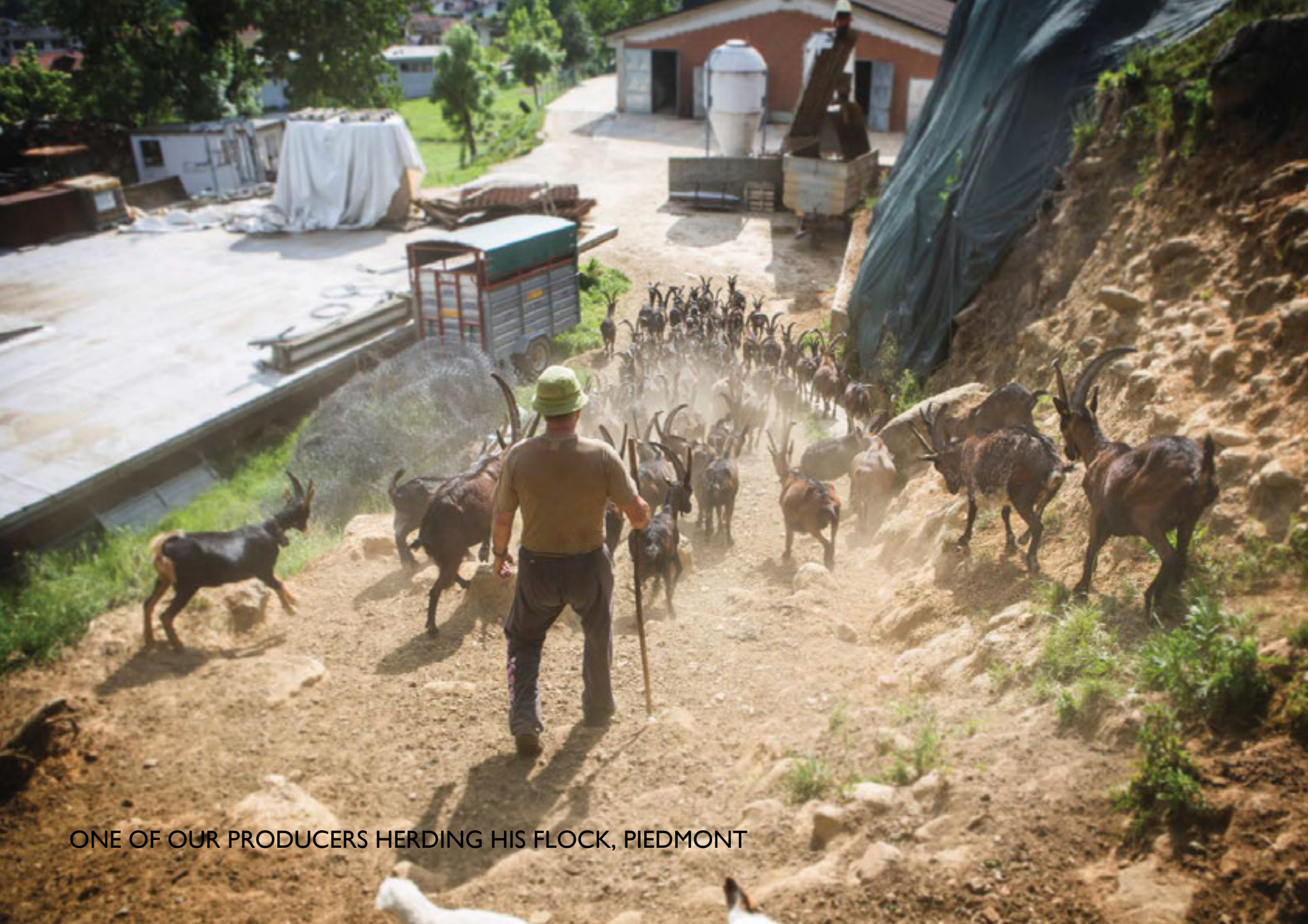
ONE OF OUR PRODUCERS HERDING HIS FLOCK, PIEDMONT