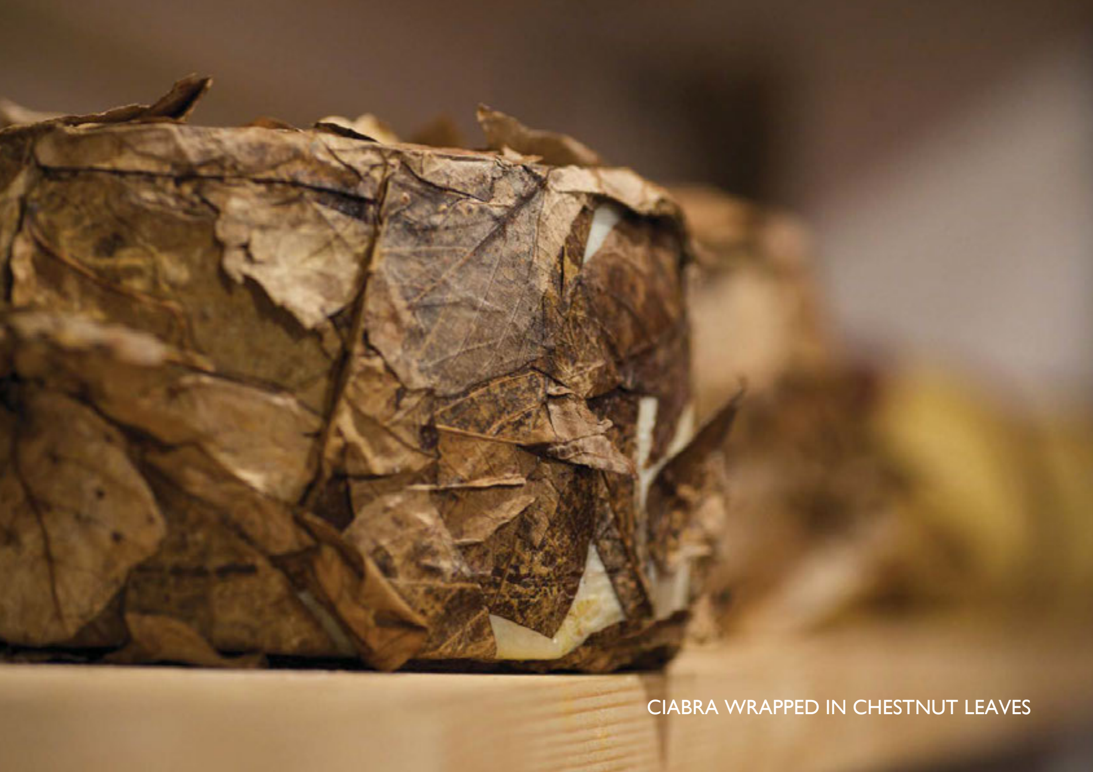
CIABRA WRAPPED IN CHESTNUT LEAVES