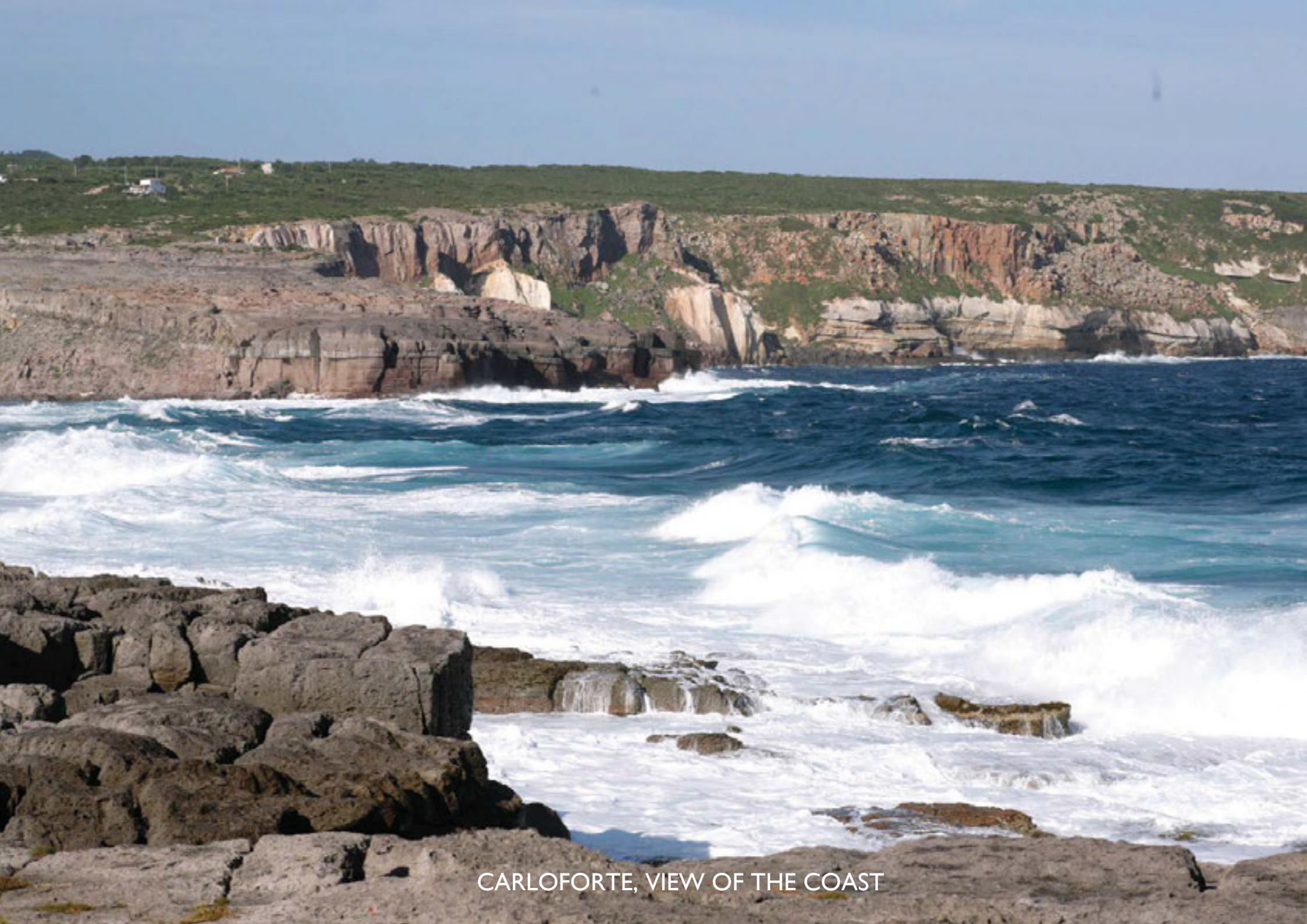
CARLOFORTE, VIEW OF THE COAST